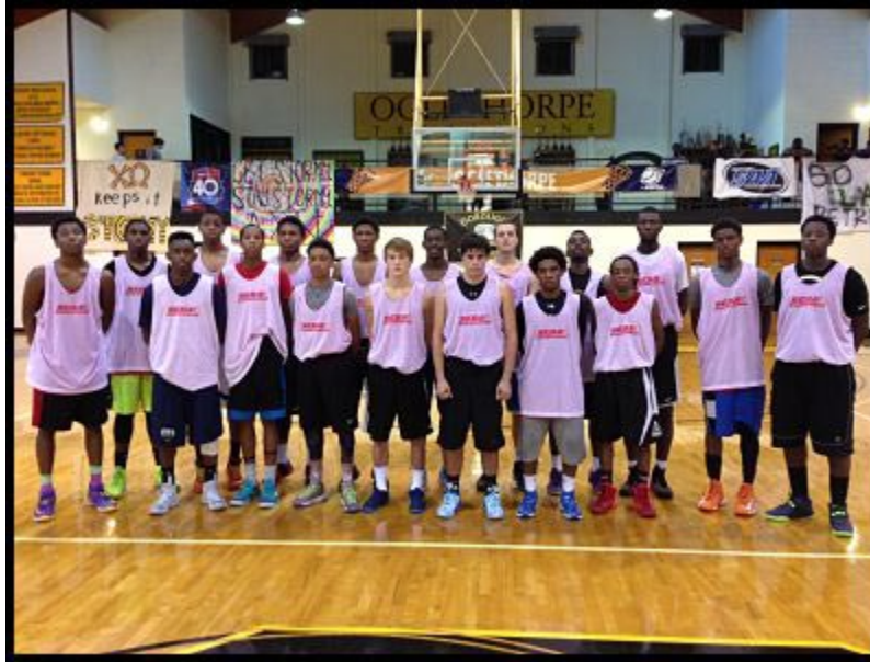
Team Photo of "East" Squad (2014 Top 30 SEBA Shootout All-Star Game)